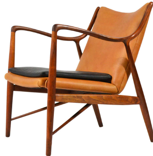
1945 Model 45 Chair, by Finn Juhl